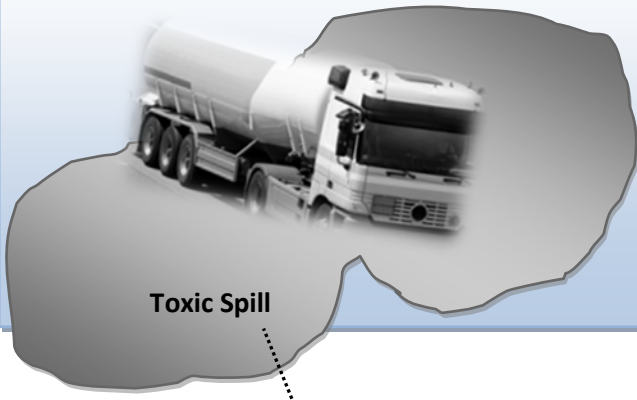
DIAGRAM IS NOT TO SCALE.

To keep this from happening, long, serpentine ditches were built into the basins to act as a detour. This gives Authorities 30 minutes to reach the site and close a shutoff valve.